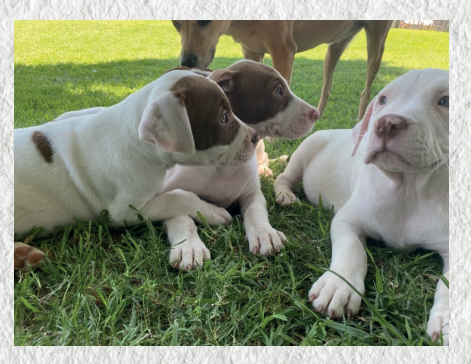
Click here for cuteness overload

Twenty grade twelve learners spent Saturday, 25 February 2023, at Husky Heaven for their Life Orientation community service hours.