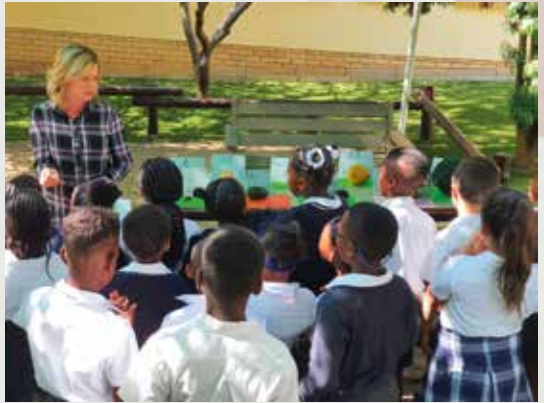
Grade 1 s praying for their grandparents after being inspired by the story of Simeon and Anna in the Bible