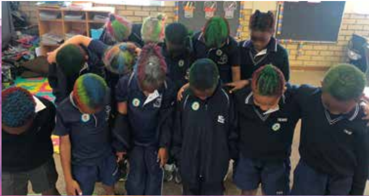
THE SPECIAL HEADS OF OUR GR. 1ME CLASS.